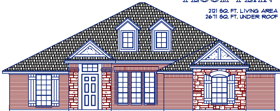
ELEVATION (Side Elevation with Stone)

2121 SQ. FT. LIVING AREA 2671 SQ. FT. UNDER ROOF